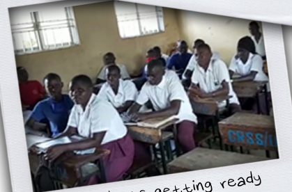
S4 students getting ready for exams this year