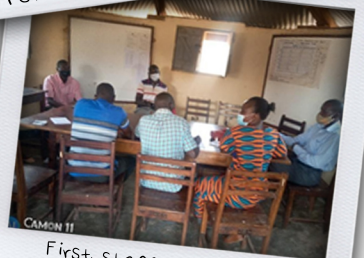
First staff meeting after the pandemic

"Thank you so much for your efforts towards Crossroads students and staff. The return to school has begun well. All the teachers have returned.