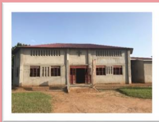
IDP (Internally Displaced Persons) Memorial Baptist Church.

In 2003 many IDPs (Internally Displaced People), who had fled to the relative safety of Soroti, were gathered under a glorious fire tree to worship in Nakatunya.