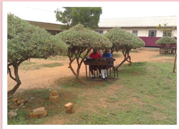
Students revising in the shade

We had an amazing response to our plea to help up to 74 pupils at Crossroads School. Many children had been unable to pay their school fees because of the dire economic climate. As a charity we have a commitment to Crossroads Secondary School to pay for staff salaries and sundries such as textbooks for the new National Curriculum in Uganda and Bibles for pupils new to the school. We are also committed to providing a substantial meal each lunchtime. However, times are exceptionally difficult for parents and carers. Partly due to the pandemic and persistent drought, costs have risen by more than 40%. Financial hardship and ruin has caused a lot of suffering and even more poverty for the students at Crossroads.