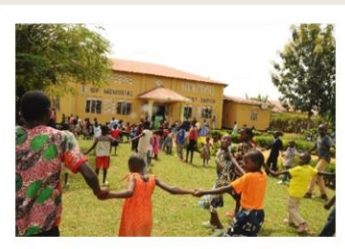
IDP Memorial Baptist Church celebrating 19 years

“Enabling better health, education and quality of life through sustainable partnerships with local communities in Soroti, Uganda.”