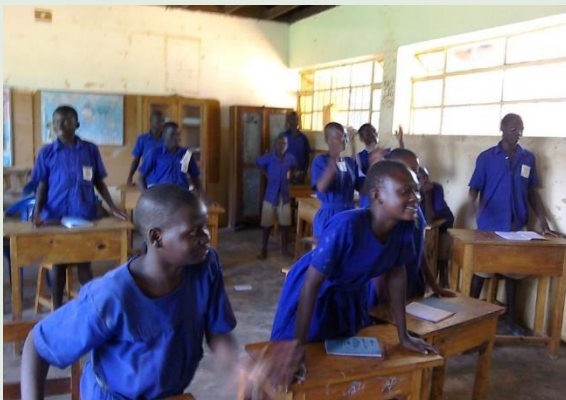
Pupils from Ngora School for the Deaf.

The increasing cost of living expenses has meant that the school fees at Ngora School for the Deaf have gone up slightly. We support six students who go to this school and are happy to announce that Global Challenge is still able to keep our commitment to support them through their primary into secondary education. All six students have been able to return to school after the pandemic.