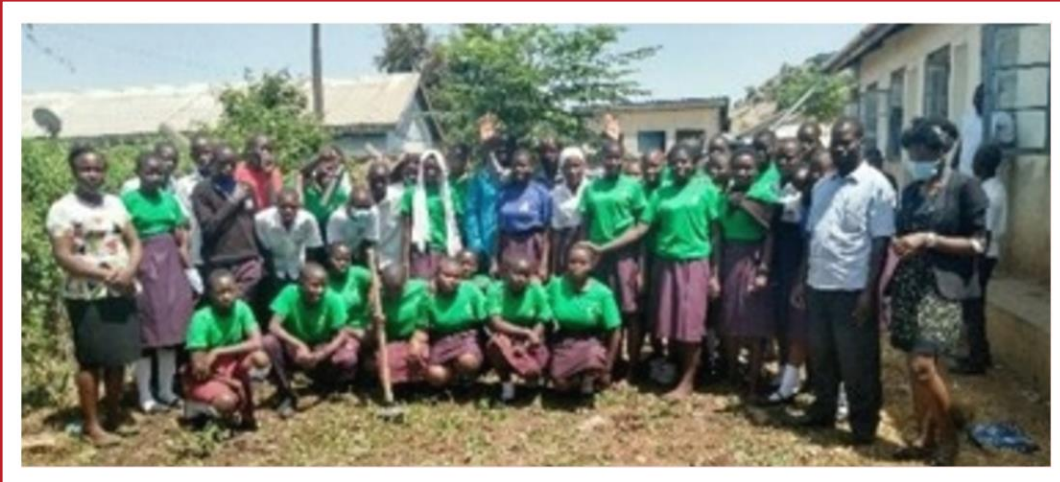
Crossroads School is very proud to have been selected for a national programme which encourages students to take more care of the environment. Students have recently been planting saplings on their school grounds.